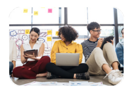
307 000 Students